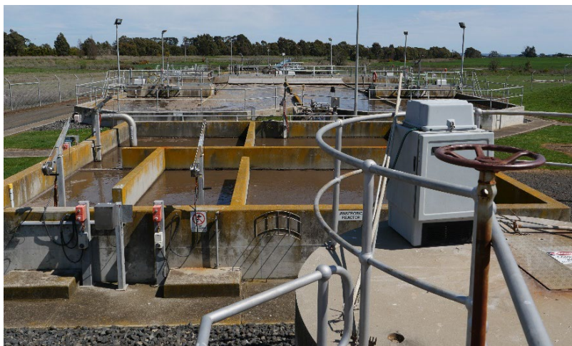
Above: the Biological Nutrient Removal treatment process at Kyneton