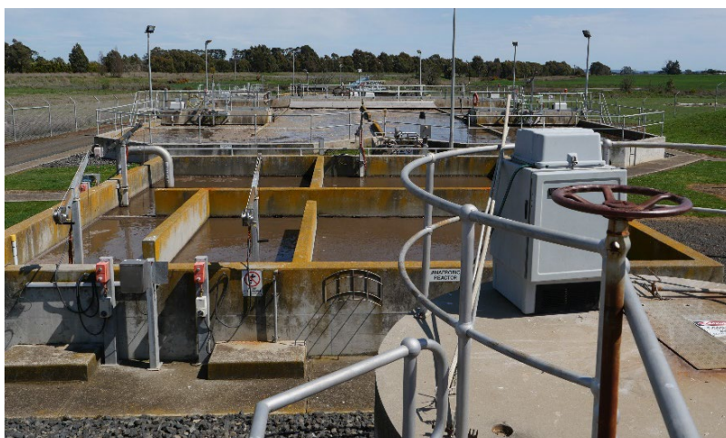
Above: the Biological Nutrient Removal treatment process at Kyneton