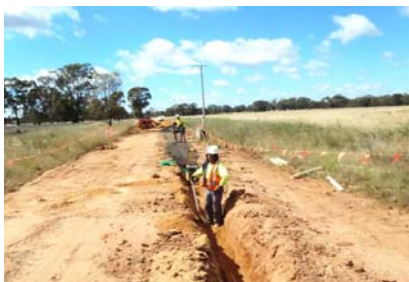
Above: Stage 1 pipeline construction, March 2011.