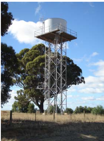
Pictured: Elevated water tank in Raywood

Initially we will continue to use the existing Sebastian tank site while we investigate various tank site options to finalise the preferred location.