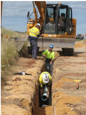
Above: Construction starts on Raywood-Sebastian pipeline