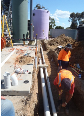
Above: Stormwater drainage and backwash water pipes being installed, October 2011.

A dedicated project web page has been developed to provide the latest information and photos on this project. Click on the link to "Major Projects" at www.coliban.com.au