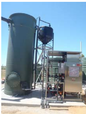
Above: The Magnetic Ion Exchange Unit, November 2011.