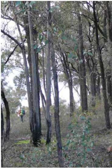
Box ironbark forest