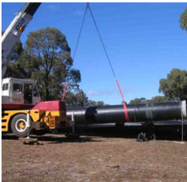
Pipes delivered to Phillis St