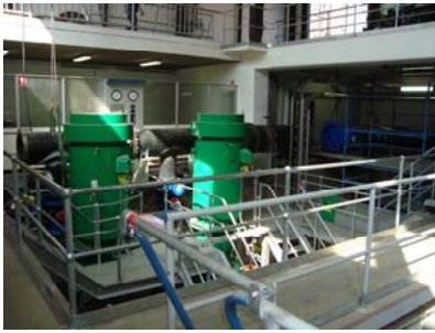
Two of the new pumps installed at the Lake Eppalock Pump Station.