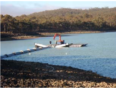
Installation of the new inlet pipeline at Sandhurst Reservoir.