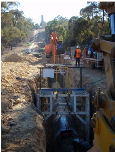
Pipe laying within the Spring Gully Reservoir catchment.

The Project Information Desk is available to provide information and respond to enquiries.