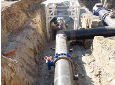
Connection of the new pipe into the existing pipe near Sandhurst Reservoir.

Landholders who have any queries or concerns can raise them directly with the National Australian Pipelines site supervisor during construction, or contact Coliban Water on the project free call number of 1800 232 722 or email esproject@coliban.com.au