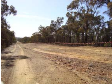
Topsoil stripped as part of Stage 1