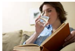
Average daily usage in litres

We then calculate your average daily water usage by dividing the total consumption for the property by the number of days in the billing period. Your daily average consumption will determine the proportion of your water usage that falls within each step of the tariff. To help you manage your future water consumption, the graph on your account shows your historical average daily consumption.