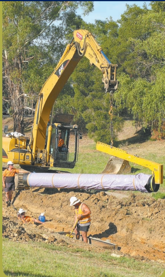
Leed Engineering construction crew works on laying pipe along Spring (Back) Creek on Wednesday.

Progress on the Epsom to Spring Gully pipeline