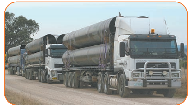
Above: Pipe deliveries to construction location along Myola Road, last month.