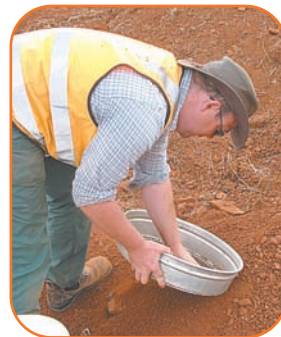
Top left: Removing pump platform formwork after concrete pour. Above: Archeological investigations on Mt Camel Range.